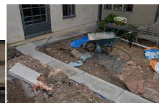
Concrete ducting enclosing a range of pipes. Note insulation placed above and below the pipes. Inset, with the lids added, later to be covered with gravel.