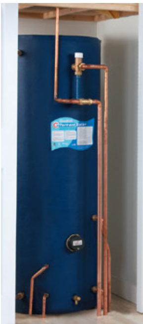
A Gledhill Torrent thermal store

The cylinder is an integral part of the solar installation. If we supply it as part of a solar installation to an existing domestic property, VAT is charged at only 5%.