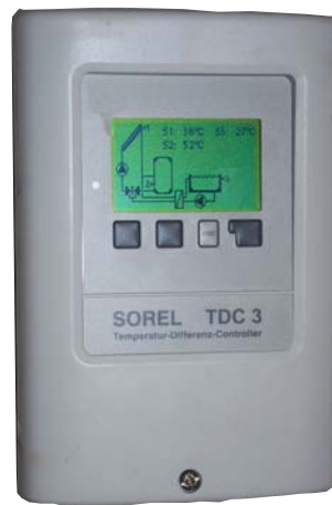
Controller (110 x 160 mm)

The controller, technically a Temperature Differential Controller, measures temperatures from three sensors and based on these readings switches the pump on and off. One sensor is in the solar collector (using cable inside the twin bore solar pipework - see left), one at the bottom of the cylinder or thermal store (where the solar is heating) and one at the top (where water exits for the taps).