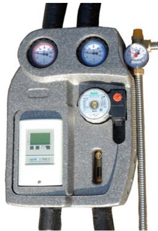
Pump station (310 x 440 mm)

Regulations state that there has to be an overflow system that could not scald users. The easiest way is to leave a storage device in the loft but other approaches are possible.